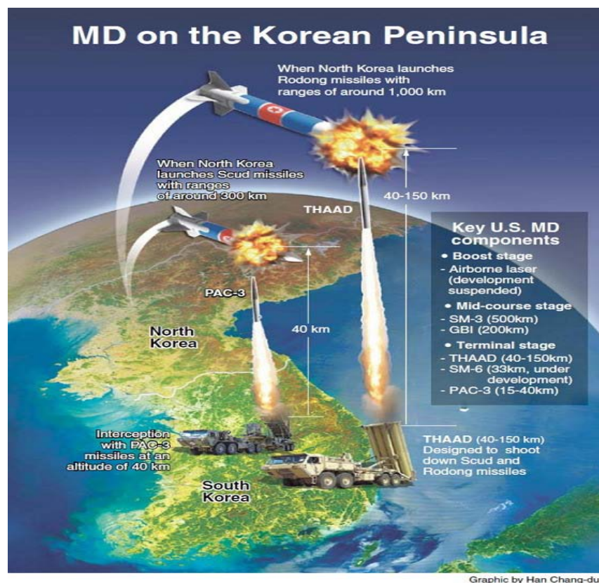
Figure 1. Missile Defense on the Korean Peninsula